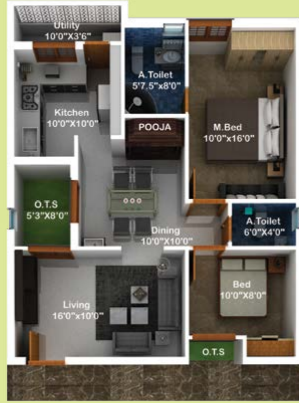
FLAT : 2 Area detail : 1048 Sqft