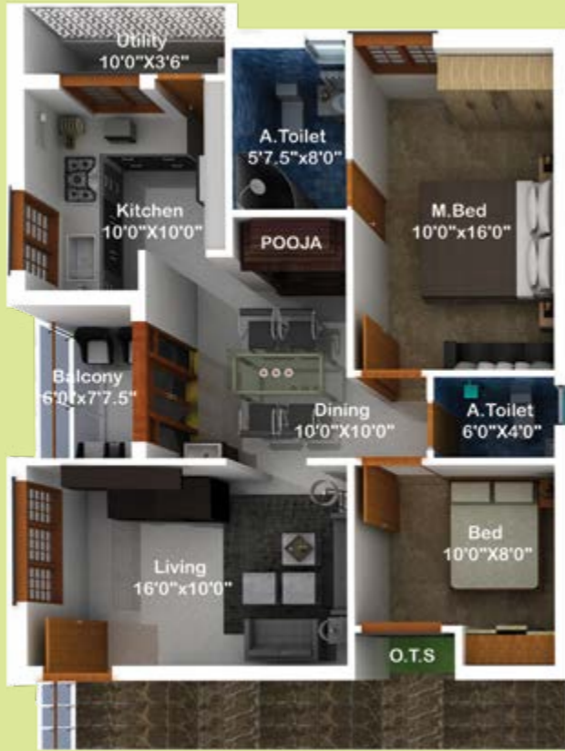
FLAT : 1 Area detail : 1119 Sqft