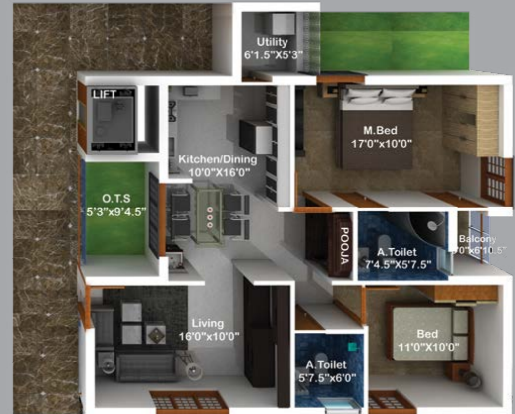
FLAT : 5 Area detail : 1188 Sqft