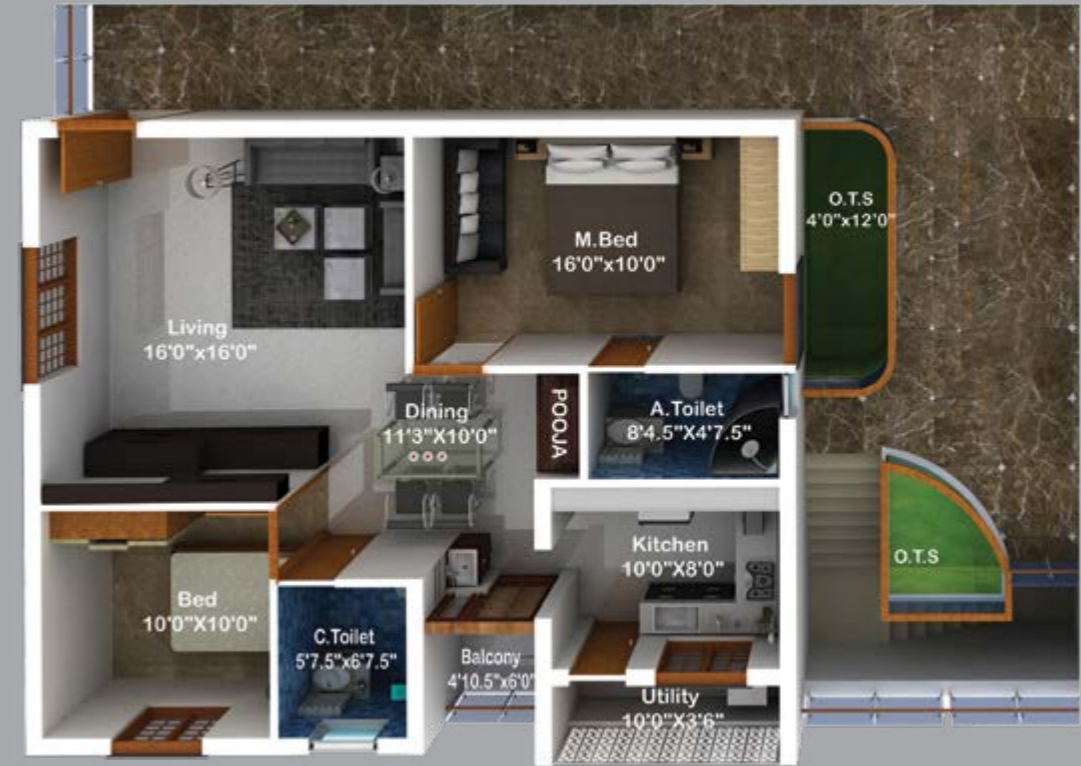
FLAT : 4 Area detail : 1133 Sqft