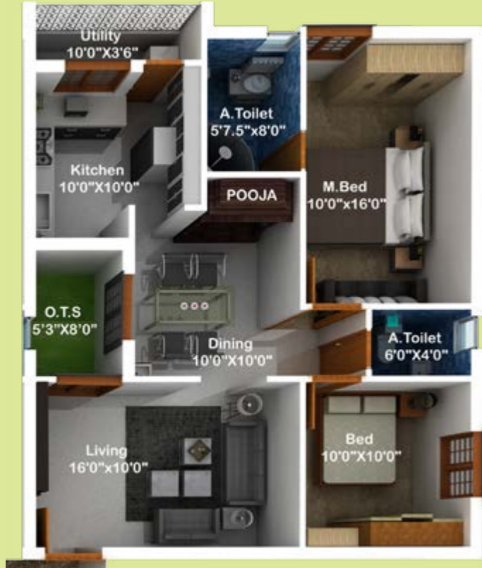
FLAT : 3 Area detail : 1071 Sqft